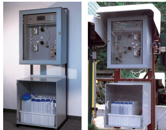
For use in harsh industrial environments: Mercury Process Analyzer PA-2

To provide optimum protection against corrosive environments all parts of the PA-2 Mercury Analyzer are enclosed in an industrial-grade cabinet made of fibreglass-reinforced polyester (protection class IP 66; NEMA 4X; etc.). The electronic circuitry is shielded from the wet chemical section by a chemically resistant wall.