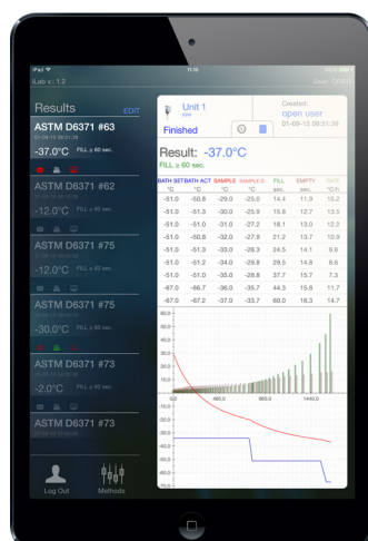
Typical CFPP result of a -37°C test.