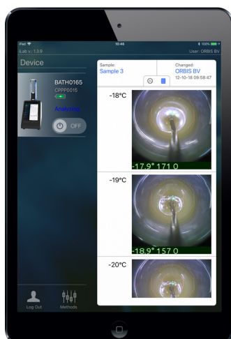
Images taken during PP test are stored in the result.